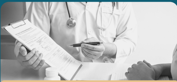
Rehabilitation Medicine Consultation

Comprehensive with a home-like environment